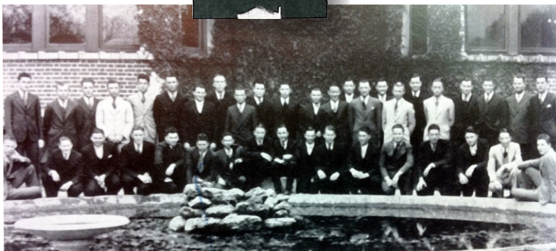
Phi Kappa Nu Fraternity (predecessor to the Beta Omicron Chapter) gathered outside Caldwell Hall, circa 1935.